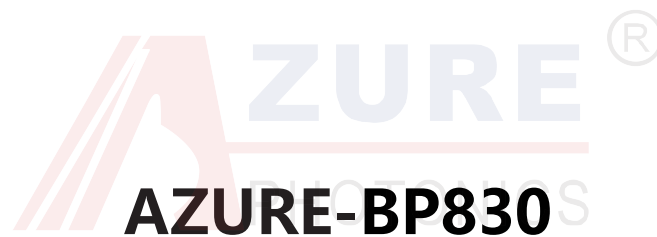
BP830 Transmission Data(Typical)